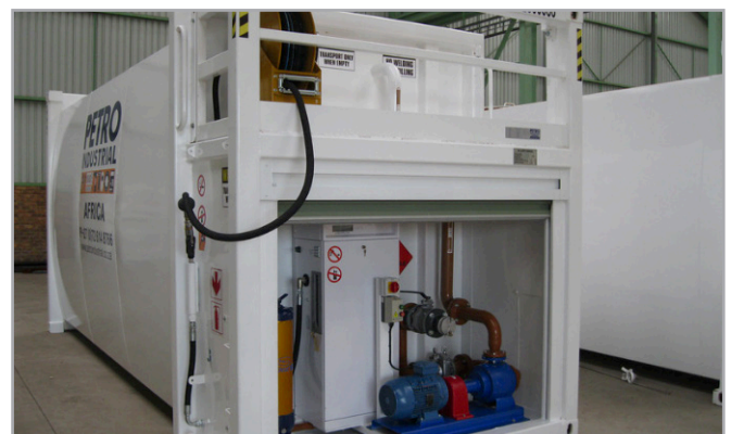
Liquitainer Integrated Self Bunded Pump Bay