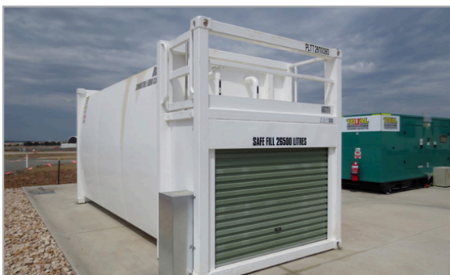
Liquitainer being used for Generators