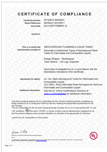
Certificate of Compliance #20120912-MH49221 for UL 142, ULC-S601.