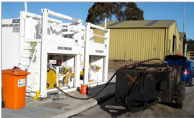
Refueling at a Liquitainer