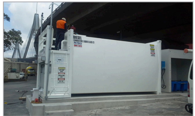
Liquitainer on Site